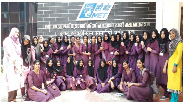
Department conducted a visit to Science and Technology Park, Athani, Thrissur with the first year BSc students on February 2019